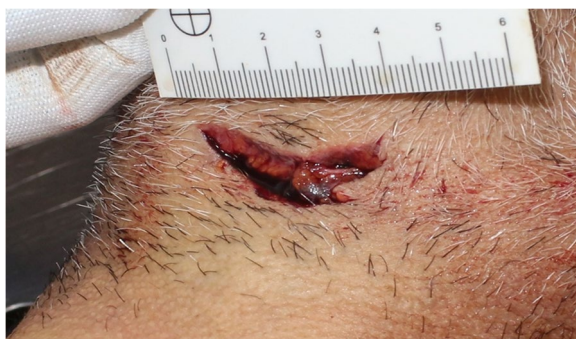
Fig. 2 A stab wound complex representing two intersecting stab wounds on the larynx. After stabbing himself in the throat, the deceased pulled the knife back and stabbed himself a second time