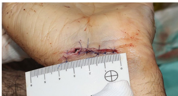
Fig. 3 The hesitation mark without incapacitation